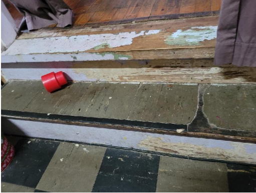
Bedroom A(002) D-Wall, Right Wood Stair Tread and Riser Lead-Positive, Deteriorated