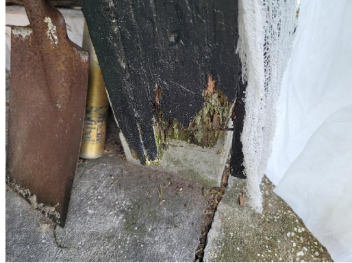
Exterior(009) A-Wall, Left Wood Garage Door Jamb Lead-Positive, Deteriorated