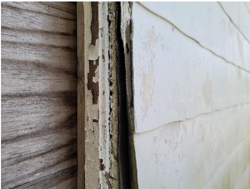
Exterior(009) B-Wall, Left Wood Door Jamb Lead-Positive, Deteriorated