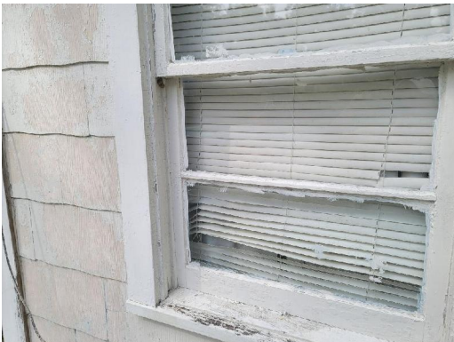
Exterior(009) C-Wall, Left Wood Window Components Lead-Positive, Deteriorated