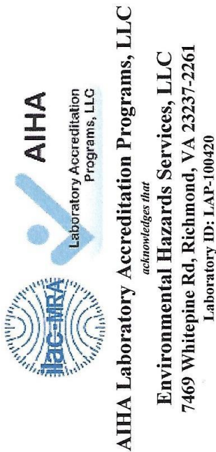
Exhibit D - LEAD RISK ASSESSMENT REPORT

along with all premises from which key activities are performed, as listed above, has fulfilled the requirements of the AIHA Laboratory Accreditation Programs (AIHA-LAP), LLC accreditation to the ISO/IEC 17025:2017 international standard, General Requirements for the Competence of Testing and Calibration Laboratories in the following: