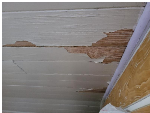
Bedroom A(002) D-Wall, Center Wood Ceiling Lead-Positive, Deteriorated