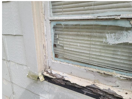
Exterior(009) D-Wall, Right Wood Window Components Lead-Positive, Deteriorated