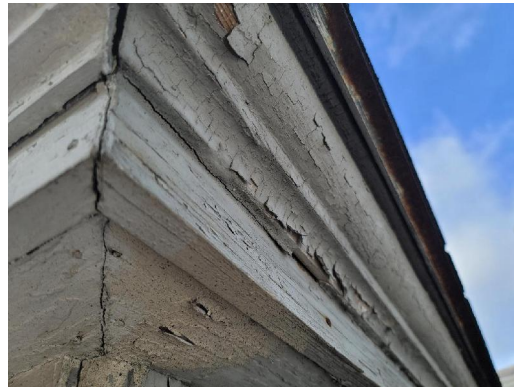
Exterior(009) C-Wall, Center Wood Soffit and Fascia Lead-Positive, Deteriorated