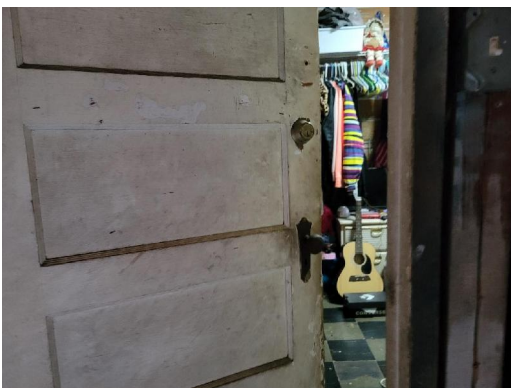
Garage(001) D-Wall, Center Wood Door and Jamb Lead-Positive, Deteriorated